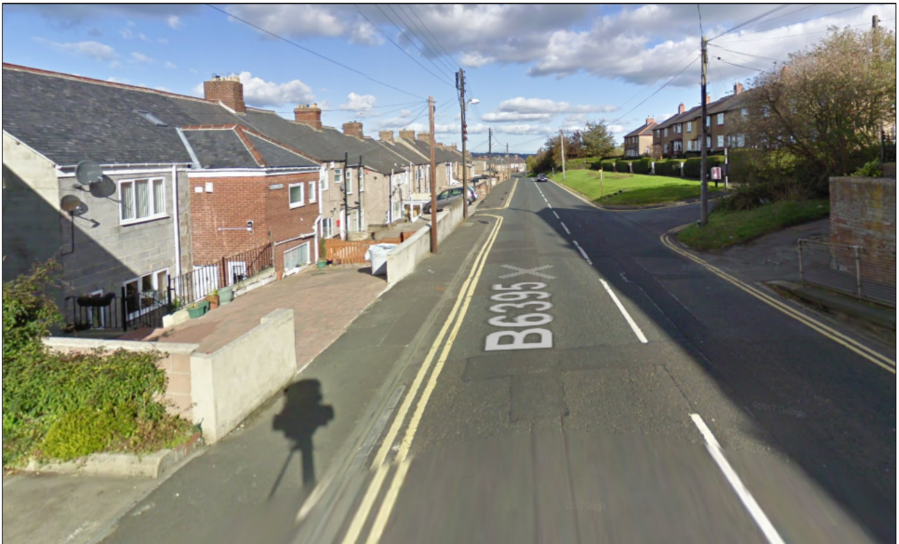
Fig. 1. Looking east. Beech Grove is on the left.

Beech Grove is a terrace of 29 residential properties located on the north side of the B6395 in Prudhoe. This is the main road into the town from the west. Double yellow lines are in place along the entire frontage of the properties. Most properties have created parking spaces for at least one car within their curtilages, though some do not have any off-street parking. There is no vehicular access to the north side of the terrace. A view looking east along Beech Grove is shown in Figure 1, below.